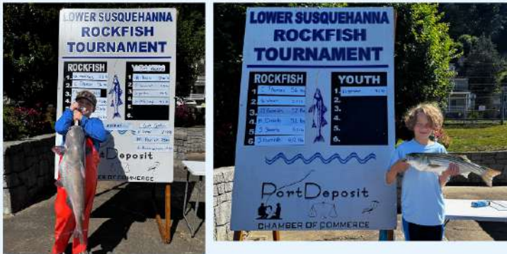
First Place youth Catfish and Rockfish Winners posing with their winning catch

The Rockfish Tournament in Port Deposit completed its' 18th year. Like all fishing tournaments, the contestants were hoping for great weather and that is exactly what they got on June 1. Over 125 adults participated in this years tournament for the grand prize, and a bunch also signed up for calcuttas, which are side categories in which one can buy in and the winner gets the pot. Adults are not the only ones enjoying this annual event. This is a huge family event and the youth of adult competitors have their own division in which anyone under 16 can join and compete. The adult and youth winners brought in fish 5.6 and 4.8 pounds respectively. It should be noted that currently the Striped Bass population is being closely monitored and the Maryland regulations say your fish must be at least 19" and cannot exceed 24" in hopes of increasing their population.